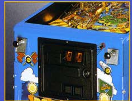
The left-side plunger launches the ball on a skill shot that cracks Ted on the head.

There's a lot to see and do in RED AND TED'S ROADSHOW—more than one player can get to in a single game. That's why we've added a buy-in feature to keep 'em coming back for more, and more...which is exactly what you can count on getting with RED AND TED'S ROADSHOW.