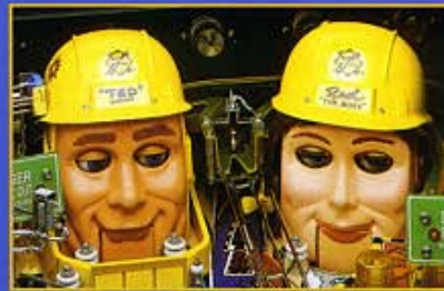
With real hair and eyelashes, Red and Ted are the second generation of Williams' successful PinMation concept.

Hit the road with RED AND TED'S ROADSHOW™. You're guaranteed a good time because Red and Ted are the new, more advanced versions of Williams' blockbuster PinMation™ concept and cousins of FunHouse's Rudy.